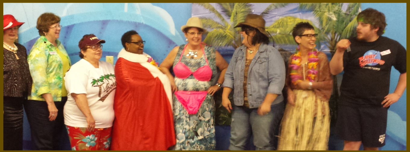
“Lethal Luau” Murder Mystery Dinner At Schlitterbahn Water Park