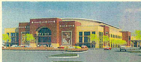
United Wireless Arena