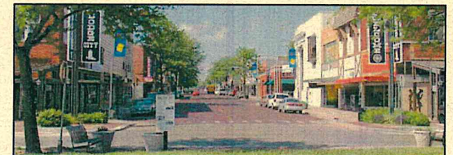
Downtown Dodge City